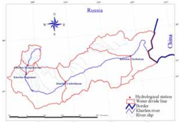
Figure 1. Kherlen river basin

Highest flood event in Kherlen river basin were observed in 1933, 1954, 1959, 1967, 1973, 1984, 1988, 1990 and in 1954, at Baganuur station flood discharge reaches 1320 m 3 /sec.