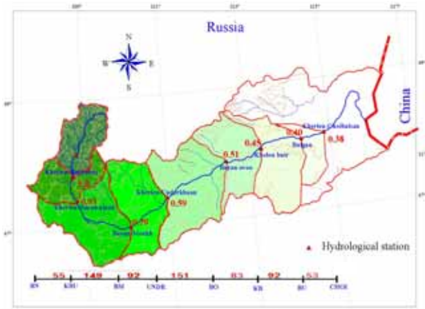
Figure 2. Flood peak attenuation coefficients along the Kherlen river

Flood peak attenuation analysis shows that flood peak at upper station-Baganuur decrease on average by 40 percent at Underkhaan and 60 percent at Choibalsan (Figure 2).